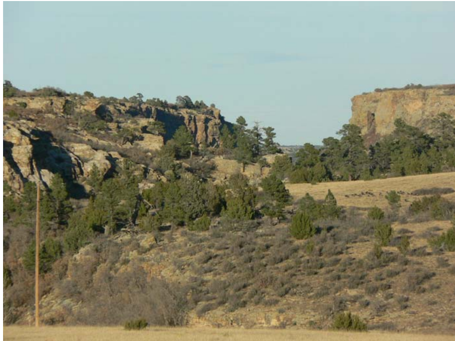
Graneros Gorge from the south