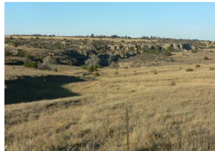
Beginning of the Gorge just south of Exit 71